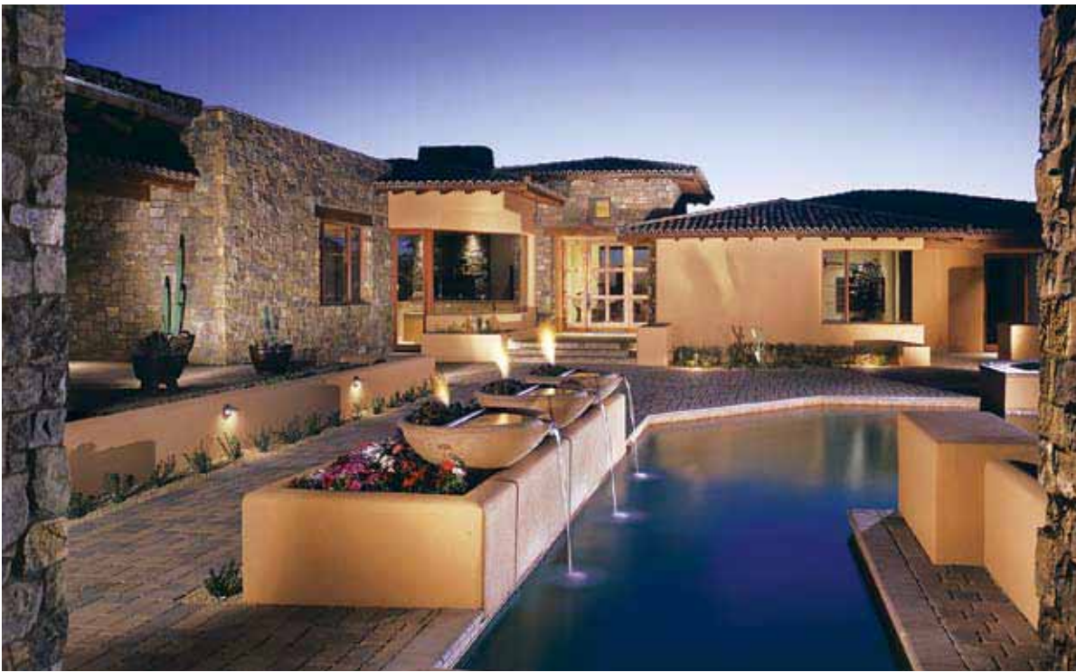
This entry courtyard with fire woks and an infinity edge pool greets visitors to this 5,300-square-foot home in the Desert Mountain area of Scottsdale, Ariz. The home was designed by H&S International and built by Platinum Homes.